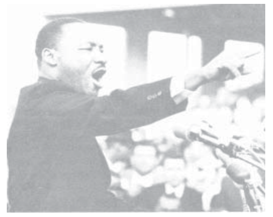
"Through our scientific genius, we have made this world a neighborhood; now, through our moral and spiritual development, we must make of it a brotherhood."