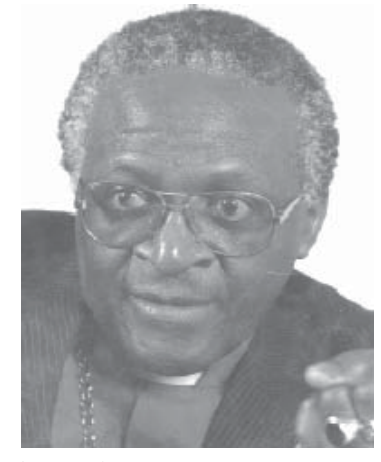
Archbishop Desmond Tutu First recipient of our Human Courage Award